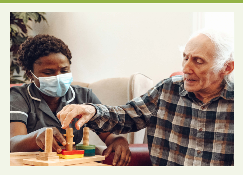
Compassion and time

Our care specialism is dementia and associated forms of the condition with Care Plans carefully formulated and recorded on our state of the art electronic care planning system. Our staff are chosen not only for their expertise and work ethic, but also for their compassion, sensitivity and dedication. Our above average staffing ratio means help is always at hand!